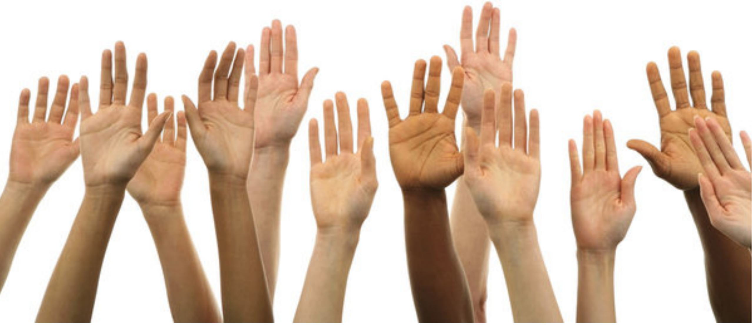
Thought Question: The design of the human body is evidence of a Creator. (True or False

Human beings were created in the image of angels. (True or False)